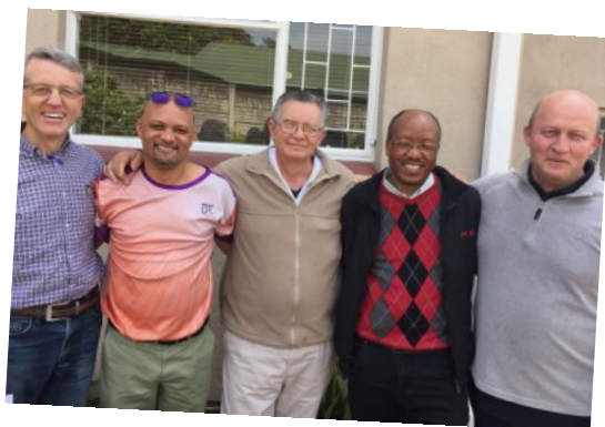
France with the EP Board