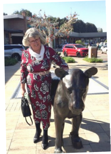
Contending with the local wildlife