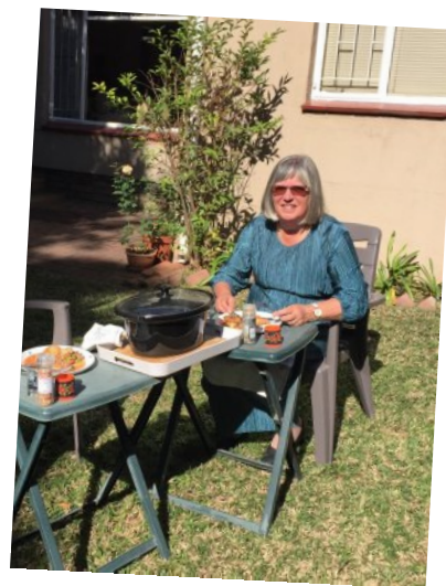
Enjoying lunch in the garden during a surprisingly rare moment of sunshine