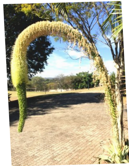
An unusual flower we spotted on a recent outing.