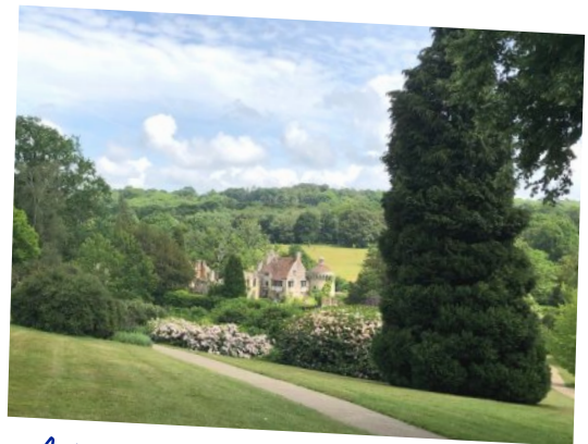
A trip to Scotney Castle is one of our favourite local walks