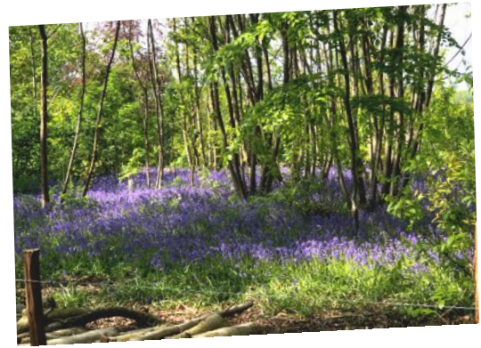
We made it home in time for the woodland bluebells nearby