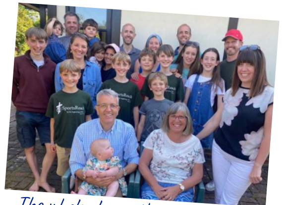
The whole clan gathered for a 70th celebration