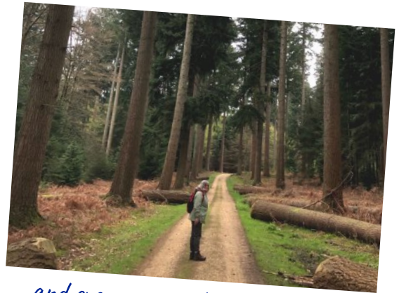
and even managed a quick visit to The New Forest