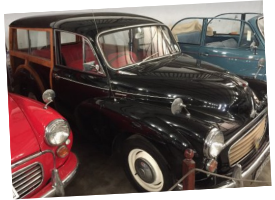
During a little down-time we visited a car museum and found a Morris Traveller, much like I used to own.