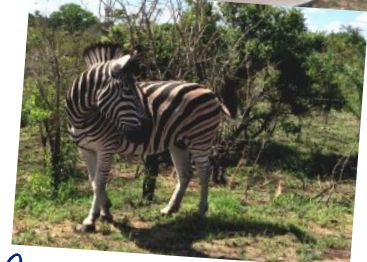
Our accomodation and some wildlife in Kruger National Park