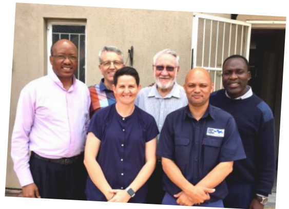
A photo call after one of our recent Board meetings

Our arrival at Emmanuel Press in Feb 2018 happened fairly swiftly. The introduction was barely two weeks before we were left 'holding the baby' as the baton of leadership was thrust upon us. Our prayer of faith has been that when we pass the baton, it will be careful and purposeful. I want to see a man who carries a passion for the local church and a desire to see young people taught well. There are a few men I have met in this category, but an African who holds these values will probably already very busy. Just today I was chatting with 2 African brothers who both love EP but are fully engaged in their own calling and missions.