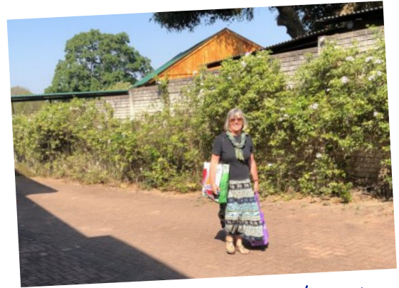
The wanderer returns carrying our weekly supplies

Following repairs, I had to collect my car from Nelspruit, so last week I had my first South African taxi experience. If you want a clue as to what that means, imagine a mini-bus crammed full with more than the legal number of passengers. Taxi drivers make their own rules on the road. No, perhaps they don't have any? Thankfully, I survived.