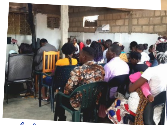
A glimpse of this week's Sunday morning meeting