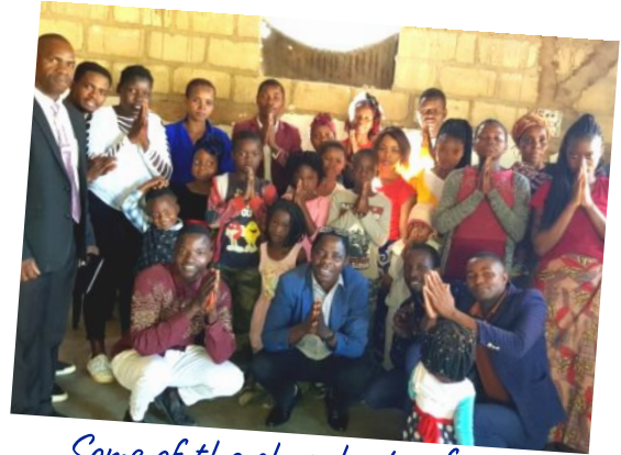
Some of the church stop for a "Thank You" photo