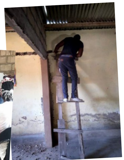
The electrician is making a start already