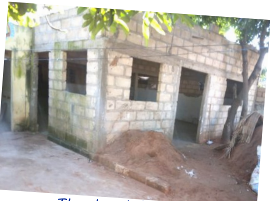
The church building

congregation of towards 60 including families. In an atmosphere where poverty is the norm, I found their singing and praises, their hunger for the preached word and their generosity of heart completely overwhelming. I was so very moved. Excuse this description but it illustrates this in a basic earthy way... the only "bathroom" facilities on the premises, is a small concrete room with no door and a raised concrete toilet seat in the corner. The only "plumbing" in the room is a bucket of water used for flushing or cold showering.