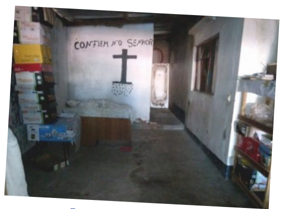
Inside the very basic Mozambique EP office