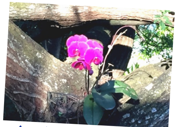
An orchid growing in a tree close to our flat.