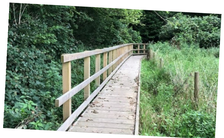
On a walk in the countryside, reminded we're following God's path ahead.

"T H A N K Y O U" says it all - with truth, with tears and with tugs on our hearts.