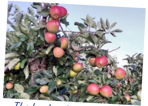
The local orchards are almost ready for the harvest.

Corinth with this wonderful truth: 'For God who said, "Let there be light in the darkness", has made this light shine in our hearts so we could know the glory of God that is seen in the face of Jesus Christ.' We are serving at EP for this purpose; to see the opening of a door for God's Glory, that many will see the light shining in their hearts as they come to know Jesus Christ. During these months of being 'locked in' the U.K. we have seen how God has opened doors of opportunity and connection for us. A door of opportunity is opening, enabling us to bring our courses to many new groups of people but more of that in a future newsletter.