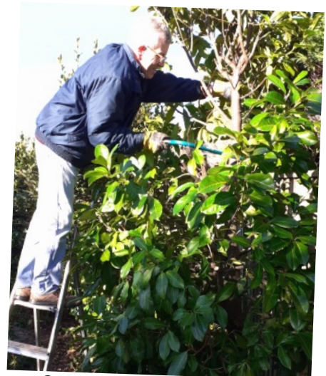
Balanced precariously on the top of a ladder again...