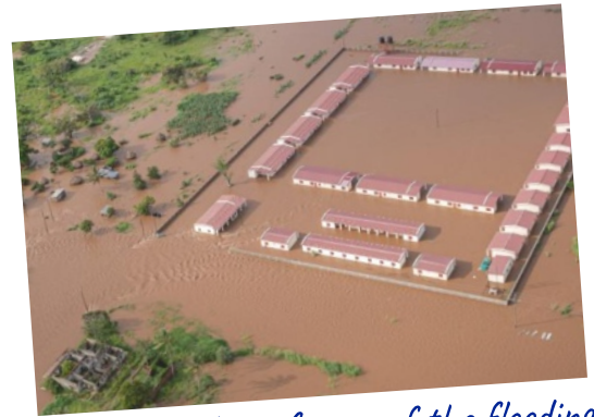
An aerial shot of some of the flooding in Mozambique

peter@emmanuelpress.org ~ kay@emmanuelpress.org