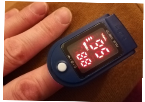
We bought an Oximeter to monitor blood-oxygen levels following our recent episode.

One week after our flight 17th December, we began to experience viral symptoms. Three days later Kay had recovered well but I was considerably worse. After 2 weeks in bed, I began to show signs of improvement, and gradually over the following weeks my strength has been returning. I’m still trying to balance rest with activity. Thank you to those who have prayed and continued to support us in various ways.