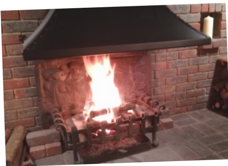
Nothing quite like being at home in front of a roaring fire with a hot drink when it's icy cold outside

Lockdown has closed the London SA visa office; our January appointment was cancelled, so we wait for the offices to reopen. Then, after their interviews, we’ll wait 3-4 weeks while they process our application. We want to return to White River as soon as possible to embark on the second half of our mission to see Emmanuel Press revived and repurposed. However, at the moment we can only wait for the doors to open.