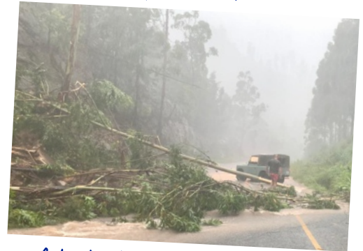
A little closer to SA home, this road is just outside White River.