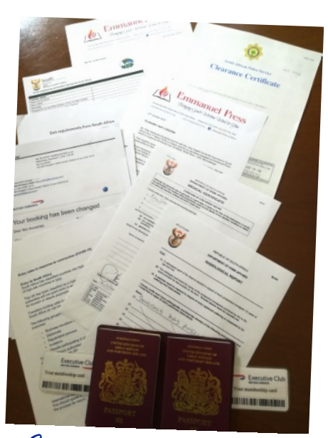
Some of the documents for out visa application

May God bless you with His peace as you step into a new year with hope on purpose.