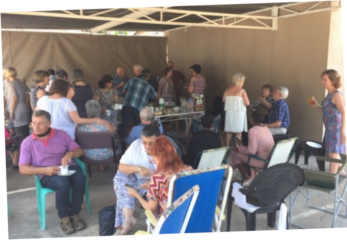
Enjoying some coffee, cake and conversation in the shade of the car-port.

Well, let me tell you something of the 'immediate' as there's nothing like the here and now to focus attention. Our team of six, plus our singing cleaner with us for ½ the week, gather each morning around God's Word and pray together. When some issues in life are tough it's a good time to find where you're anchored. Then it's coffee on, and each to our