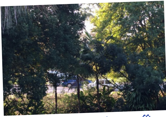
A view of the Freeway from my office window - the curfew makes little difference to the continual flow of traffic.

Our Sunday morning gatherings under the carport continue to be blessed and a slightly different mix of friends gather on Tuesday evenings for 2hrs of fellowship, Bible study & coffee.