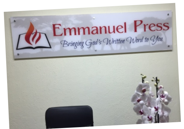
The new sign in the reception area, along with some beautiful orchids we were given

peter@emmanuelpress.org ~ kay@emmanuelpress.org