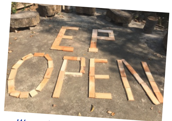
We used some firewood to make a sign to let people on Facebook know that we're open.

Whatever our speculating, we're hoping for something to steer us out of the winter waiting. It's been one of the coldest Augusts we've ever known and feels more so by seeing the temperatures rising high in England. Apparently its been the coldest winter in White River for over ten years... some even say 30 years. That being said, the winter bird songs and beautiful flowers are lovely.