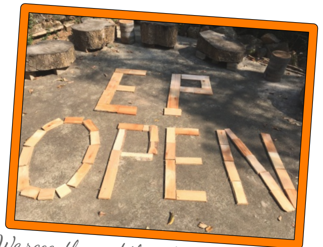
We recently used this photo, made from some winter firewood, to let our Facebook followers know that the EP office is open for business.