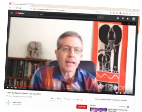
We had been scheduled to visit TWCF on Sunday 12th July so I recorded a segment for their Livestream instead