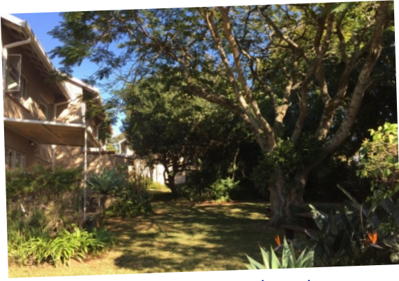
The pleasant garden at Emmanuel Press

Our Doctrine Course needs a little expanding and then I aim to write an "Introduction to the Holy Spirit". These are days when we are aware of the need to follow God's simple guidance as He speaks by His wonderful Holy Spirit.