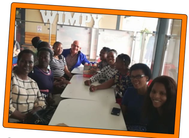
Some school EP Coordinators enjoying breakfast together