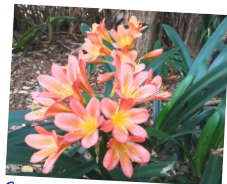
Some spring flowers in our garden