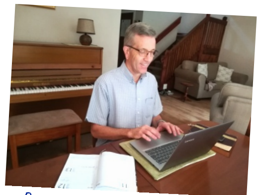
Busy writing Hot Off The Press

Thank you for your love and interest, your prayers and sacrifice, which make you a living-link in The Lord's work with us here!