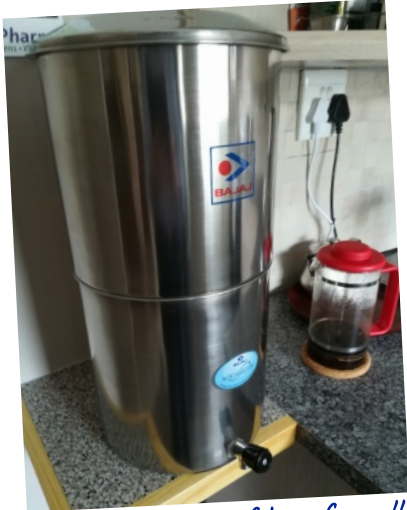
Our new water filter for all our drinking water.

enthusiasm. This week it was by candlelight in the hot evening... no fans and little breeze but plenty of laughter. We're grateful for God in our midst and encouragement from His Word.