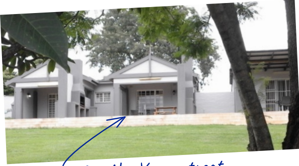
Our New Year retreat

We welcomed in the New Year behind closed eyelids and awoke to a year of promise. Knowing Jesus makes the unknown 2019 better than a known way, so we start this new year knowing God will work where we cannot. Oh Hallelujah!