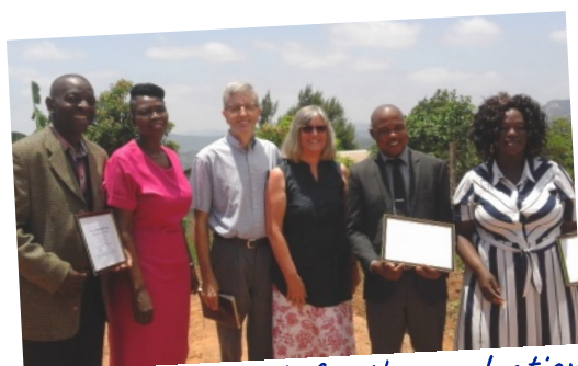
Visiting a church for the graduation of 3 EP students

Quietness returned and only then revelation dawned... We had spent the day with Jesus. We cried a little on the inside at the realisation; this is what it's all about. No wrapped gifts exchanged, but love; No pretty cards displayed, but words were real; no roast turkey, but "apples of gold in settings of silver" (Prov 25:11). "Surely The Lord was in this place" (Gen.28:16) ... yet we almost missed Him!