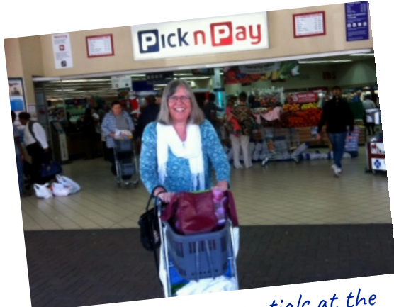
Picking up some essentials at the local supermarket

We not only need to rethink our material tools, but we need new "missioners" into the many schools in the area. Then there's the prisons ministry; such a massive "captive" audience who wait to hear the good news of Jesus coming to bring Life and Hope. Additionally we need DIY volunteers, as well as I.T. and general office skills.